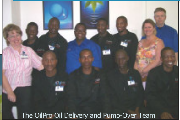
The OilPro Oil Delivery and Pump-Over Team